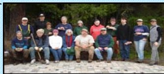
Volunteers from the Blue River Ivy Removal Event in March 2010