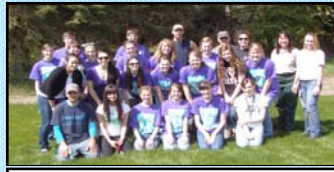
Students assisted in restoration work for the Youth Day of Caring